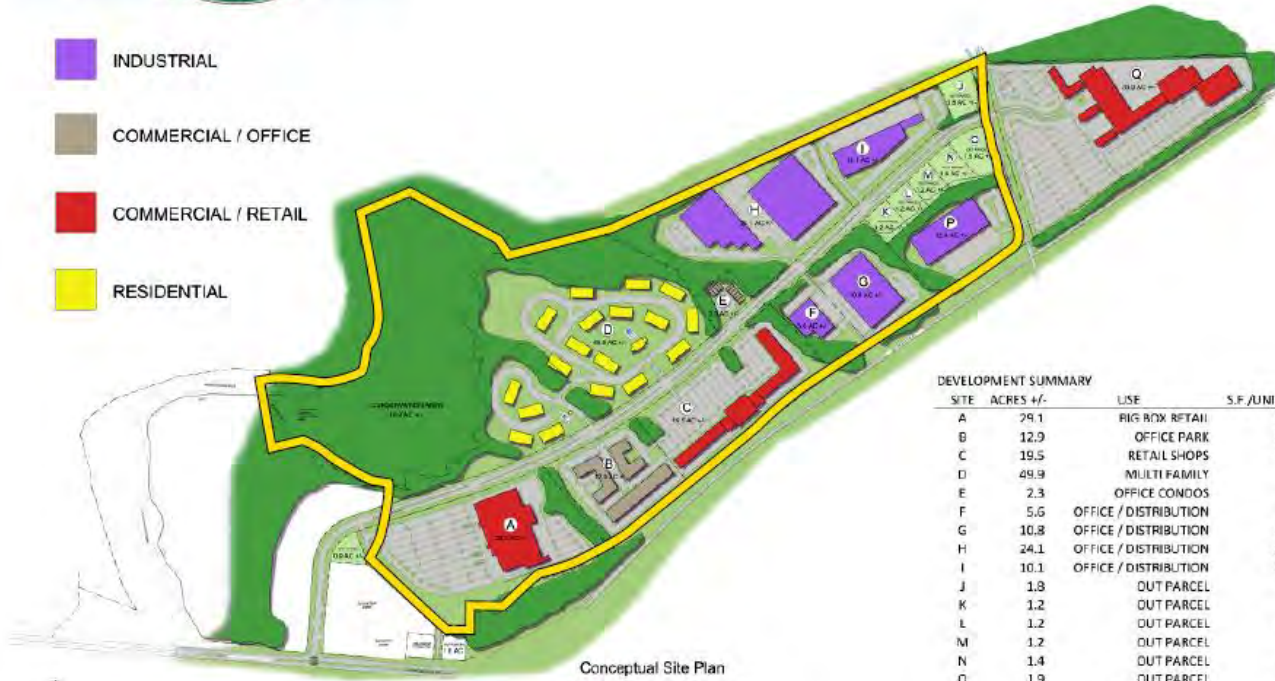
Conceptual Site Plan Jefferson Tract Jefferson, Georgia